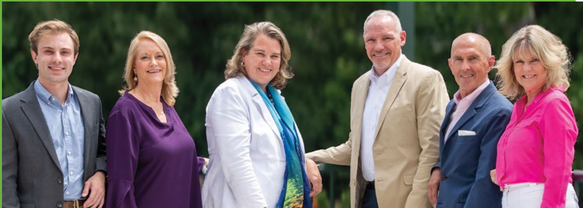
IREDELL EDC TEAM (FROM LEFT TO RIGHT)

It's our BUSINESS to ensure the residents of Iredell County enjoy the LIFE they love in what we consider to be the best LOCATION in the world.