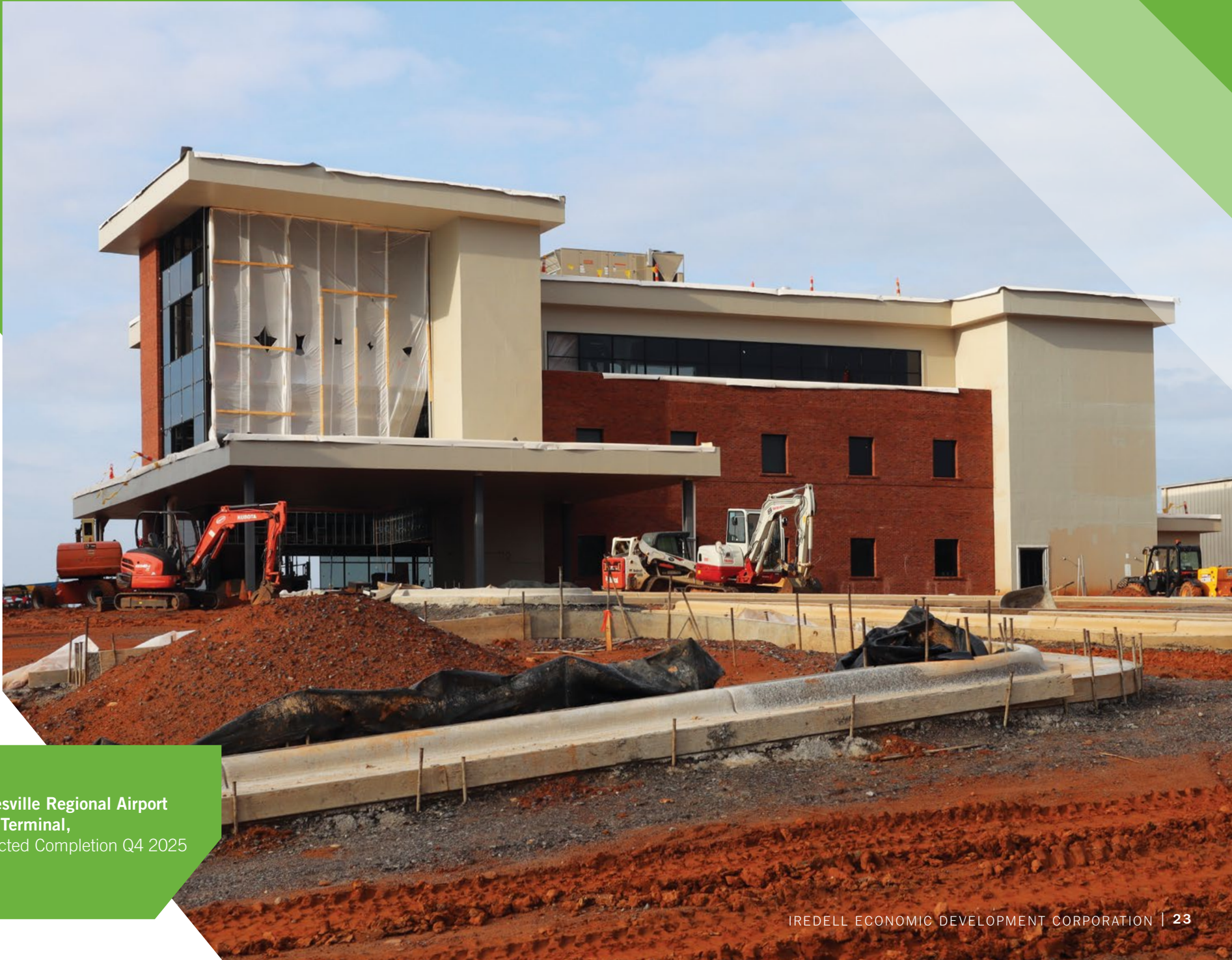
Statesville Regional Airport New Terminal, Expected Completion Q4 2025